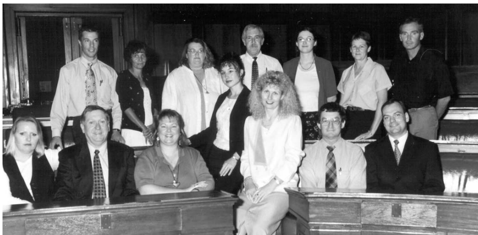
The Consensus Conference Lay Panel

Money. Money also plays an important role in shaping the consensus conference process. Most consensus conferences depend on a number of funding sources, with only limited amounts coming from government. Apart from those held in Denmark and the Netherlands, a growing number have been organised by non-governmental bodies – such as universities and consumer organisations – that traditionally lack sufficient resources to be the sole provider of funds. Depending on the institutional arrangements of the conference, organisers may need to source